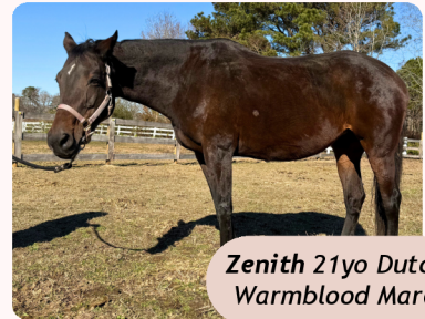
Zenith 21yo Dutch Warmblood Mare