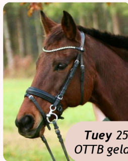
Tuey 25yo OTTB gelding