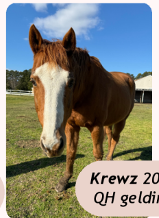
Krewz 20yo QH gelding