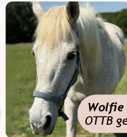
Wolfie 24yo OTTB gelding