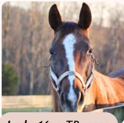
Lady 16yo TB mare