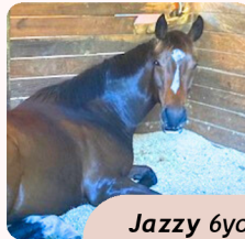
Jazzy 6yo OTTB Mare