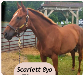
Scarlett 8yo TB mare