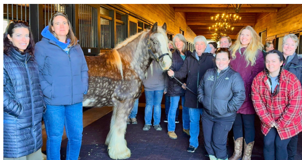
Permanent resident, Mint Julep, posing with a few new fans

Their unique program focuses on a highly effective training regimen, leveraging their deep expertise to ensure rescued horses reach their full potential in adoptive homes. After a thorough vetting and assessment, their head trainer develops an individualized, evidence-based training approach (mounted or unmounted) for each horse entering the program.